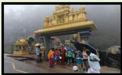
Seetha Amman temple