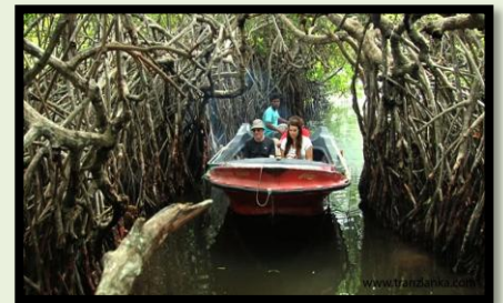
Lagoon Boat Safari