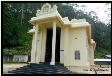
Shri Bhakta Hanuman Temple