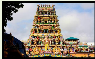
Shankar Devi Temple