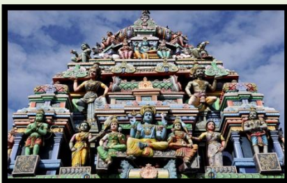
Panchanmuga Anjaneyar temple