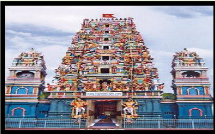
God Skanda Temple